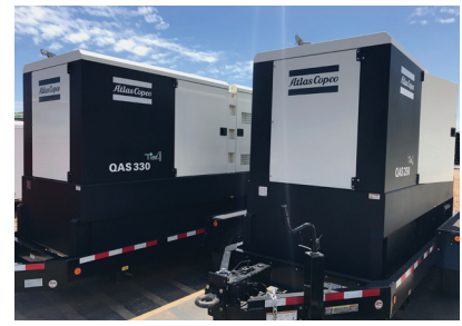
Portable & Standby Generators