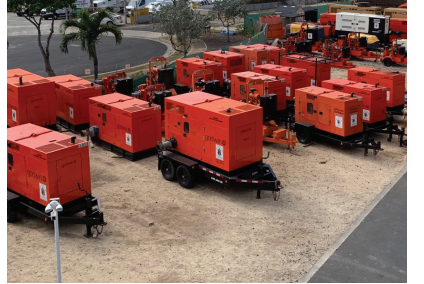
Dri-Prime Pumps for Sewer Bypassing & Dewatering