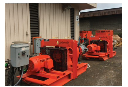
Electric Dri-Prime & Submersible Pumps