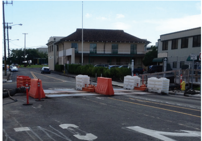
Flanged Road Crossings in a Range of Sizes